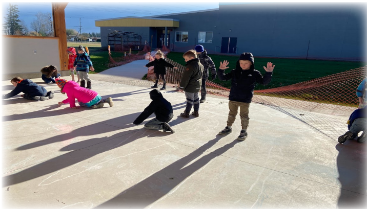
Grade Ones outlined their shadows using chalk so they could observe their shadow's movement throughout the day.