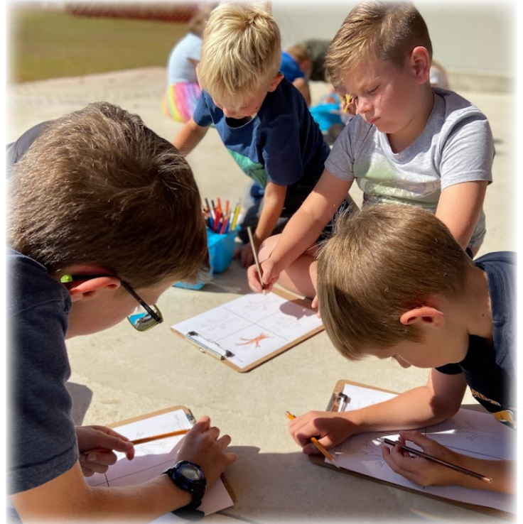
Students recording their observations of how a tree changes during different seasons.