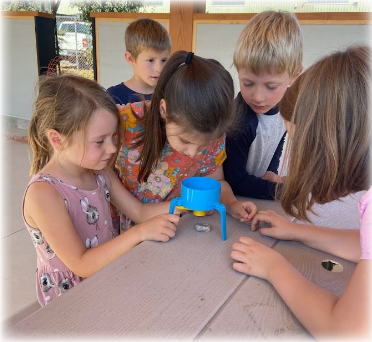
Some students observing patterns on materials found in nature. ■

The Grade Ones have loved using our new outdoor classroom to play and learn in. They have spent time observing, asking questions and learning about cycles and patterns in Science. “What kinds of patterns in the sky and landscape are you aware of?” “How do patterns and cycles in the sky and landscape affect living things?” The Grade Ones quickly realized that there are cycles and patterns all around us, happening every day. From the sun, moon and stars to shadows, seasons and weather patterns. They have gained a deep understanding of how these cycles affect living things in the environment. Grade Ones enjoy spending time outdoors and are engaged, excited and curious about what learning can look like when we take it outside.