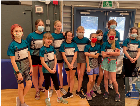
Our Girls Gr. 5,6,7 Basketball Team came in 3rd place last week in their Tournament in North Vancouver. Well Done!!