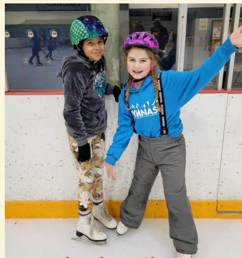
Next School Ice Skating Day is Monday March. 7th