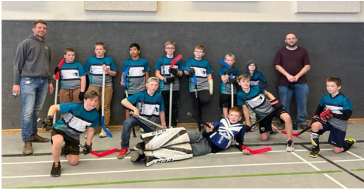
Our Gr. 5,6,7 Boys Floor Hockey Team also came in 3rd last week. Congratulations to all!

Bus Driver: Have you considered being a Part-Time Professional School Bus Driver? Now's your chance! We need a school bus driver to safely transport some extremely precious cargo, for approximately four hours per day on all school days. We need a driver with a strong commitment to safety and who genuinely cares for children. It is the opportunity for relationship that makes this career more rewarding than regular jobs. Incentives to assist with getting a bus driver license may be available. Please contact jdewaal@agassizchristianschool.com or joshvandeneykel@gmail.com to apply.