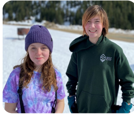
Skiing/Snowboarding and Tubing