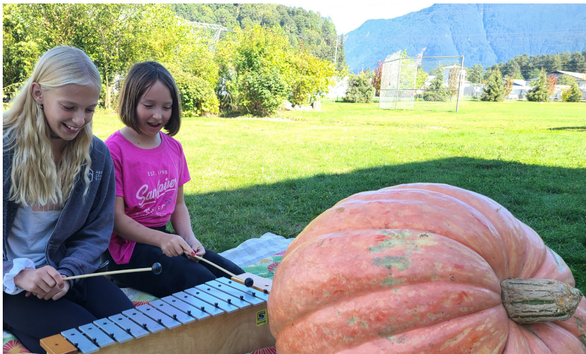
Grade 6/7 composed pumpkin-themed songs and performed them for the GIANT pumpkin that mysteriously arrived at the school. Some K/1s wonder if the surreptitious Garden Fairy gifted this enormous squash for our enjoyment!