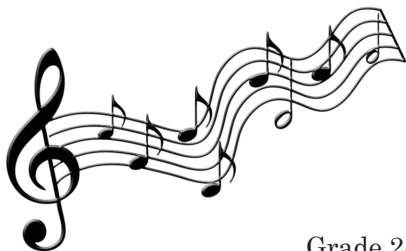
Grade 2/3 reviewed musical terms with a competitive game of Jeopardy.