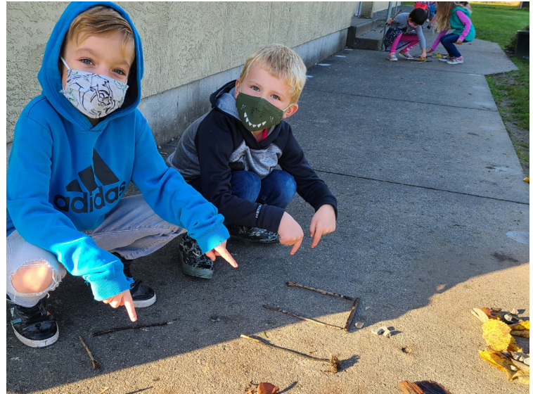
Kindergarten and Grade 1's arranged sticks and leaves to create and perform musical patterns (TiTi & Ta).

Our theme verse for Music Class this year is a reminder to have gratitude with each breath we take. We have been doing musical activities outside as much as possible. Nature has been inspirational to the students as they compose rhythms, tunes, and lyrics. As the children express their delight in the Creator and creation with much vocalization, I am reminded how Jesus responded to the Pharisees who wanted Jesus to restrain the enthusiastic praise of the children and disciples. "I tell you," [Jesus] replied, "if they keep quiet, the stones will cry out." Luke 19:40